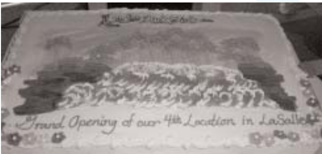
We celebrated the Grand Opening of another new location for our hosts, On The Dark Side Tanning Salons