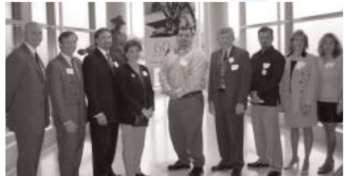
A small group of nominees