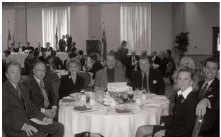
Freed's of Windsor table at the AGM.

For more details see the special flyer in this month's newsletter or call 255-5720.