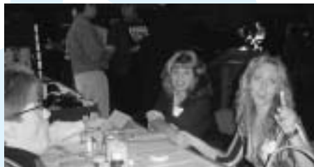
Canadian Blood Services were testing blood types