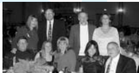
A wide variety of businesses came together and enjoyed an eight-course meal at the Ciociaro Club