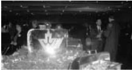
The Cleary put on a world-class event with many ornate ice sculptures and 'over the top' hors d'oeuvres

Sponsored by: The Cleary International Centre, Mackenzie Hall and Willistead Manor