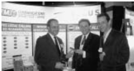
Telus - On top on their Game