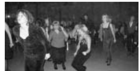
The dance floor was packed and guests partied until one o'clock in the morning