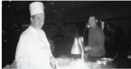
Handsome Chef carves up a feast!