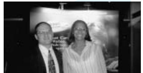
Big smiles at the Enterprise Rent-a-Car Booth