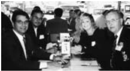
Attendees at Table 3 say, "Let's do business!"

The opportunity for you to meet your next valued client is at the tip of your fingers. This before business event offers businesses large and small an opportunity to intimately meet and network with potential new customers. Boppers Cafe, located in LaSalle offered attendees of this past event a hot breakfast and a comfortable venue to jump-start the business day.