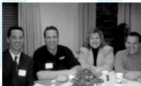
Round two of the Program brings BIG SMILES from Table 3.