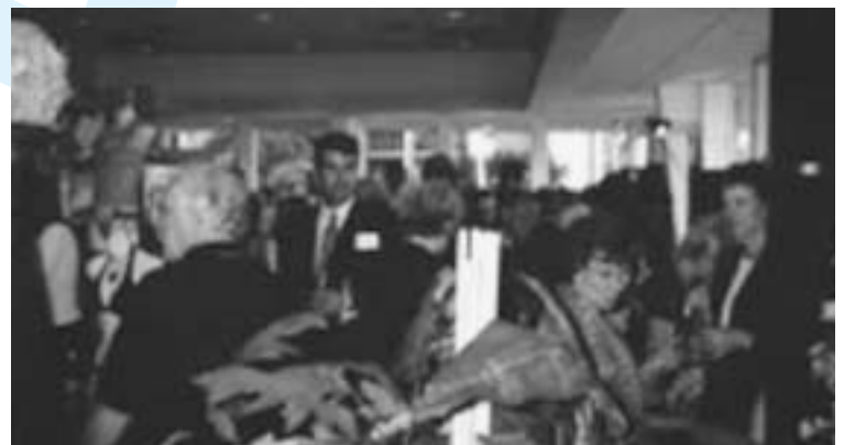
“Wall to Wall People” at our June After Business at the Windsor Yacht Club