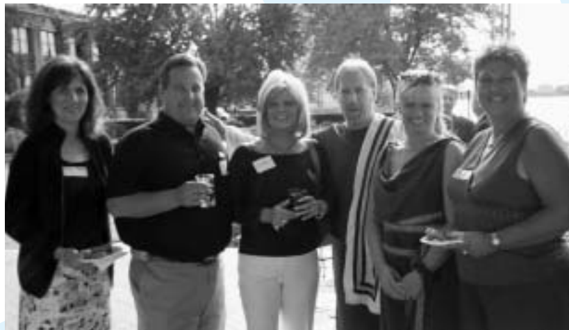
“Networking Time at the After Business” - All who attended enjoyed food by Koolini and spirits provided from the Canadian Club Brand Centre